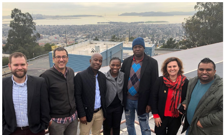
The training session at the Berkeley Lab.

One of the initial challenges that prevented implementation of the EESL program was the lack of information about the level of efficiency of the appliances sold in the market and the lack of experience in collecting this type of data. Berkeley Lab developed the International Database of Efficient Appliances (IDEA), which automatically gathers data from online retail sites and compiles it into a repository of information on the efficiency, price, and features of different appliances and devices in markets worldwide. Using this data gleaned from IDEA, the EE4D team worked with local consultants to analyze market data and